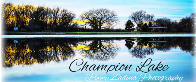
Champion Lake

Established in 1888, Champion Mill is the last functional water-powered mill in Nebraska. Started by T. Scott, the mill has changed ownership many times but is now run by Chase County. The area is used for recreation, picnics, non-motor boats, fishing, swimming, ice skating and S.C.O.R.E. Camp is held here. The mill building is open for tours. Call 308-882-5860 for details.